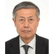
Hon. Yoshiaki Miawa Consul General of Japanese Consulate Office in Davao City